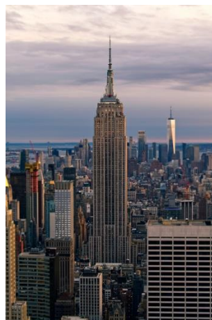
The Empire State Building, New York, USA