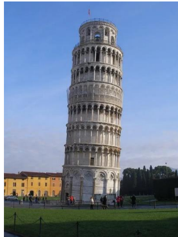
The Leaning Tower of Pisa, Italy