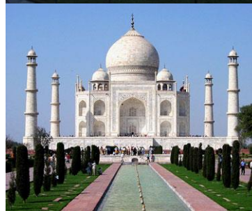
The Taj Mahal, India