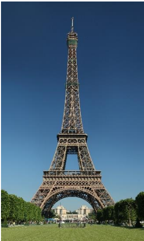
The Eiffel Tower, Paris, France

Here are some ideas you might want to try: