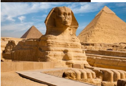
The Sphinx, Egypt